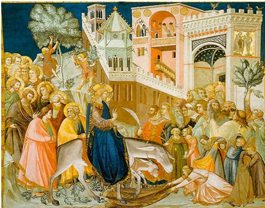
Lorenzetti, Pietro, active 1320-1348. Entry into Jerusalem , from Art in the Christian Tradition , https://diglib.library.vanderbilt.edu/act-imagelink.pl?RC=55432

34 Boucher St. East | Meaford, Ontario | N4L 1B9 519-538-1330 | office@christchurchanglican.ca | christchurchanglican.ca