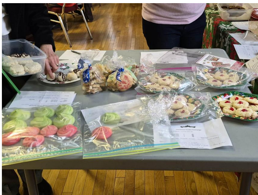
A stunning array of Christmas cookies