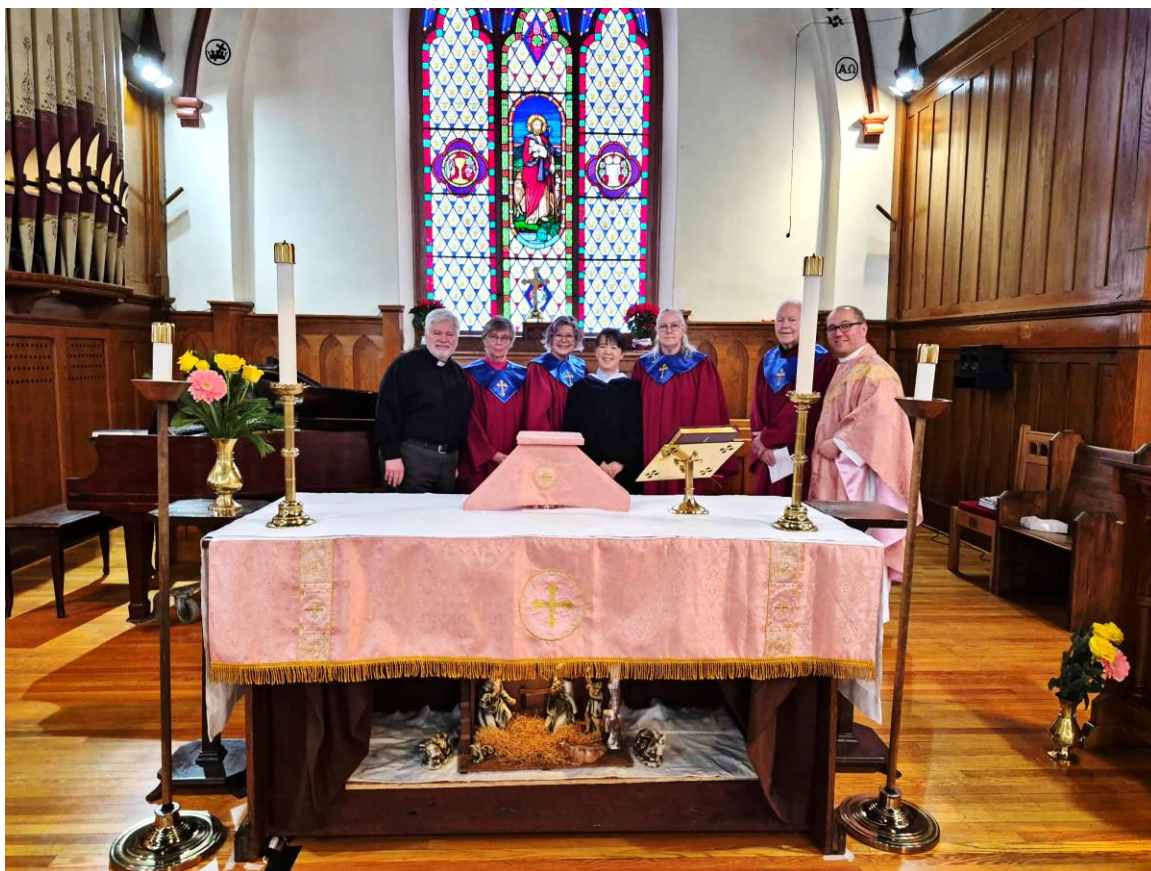
We are thankful for music & voices! - submitted by Keiko Yoden-Kuepfer