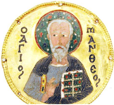
Medallion with St. Matthew. Byzantine, ca 1100.

February 8, 2026 Holy Eucharist – 10:30AM