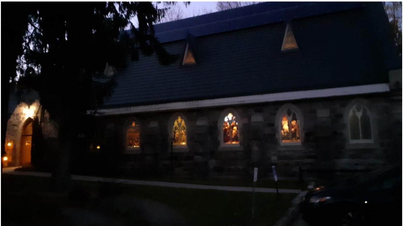
A photo of our candlelit church at the All Saints' Day service held on All Saints' Day, November 2nd, 2022.

The Church Office is OPEN Tuesdays, Wednesdays and Thursdays from 9:00am to 2:00pm. Call 519-538-1330 or office@christchurchanglican.ca